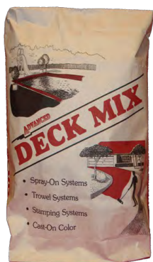
50 lb. Bag