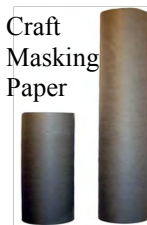
Craft Masking Paper