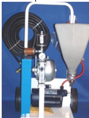
Advanced Deck Mix